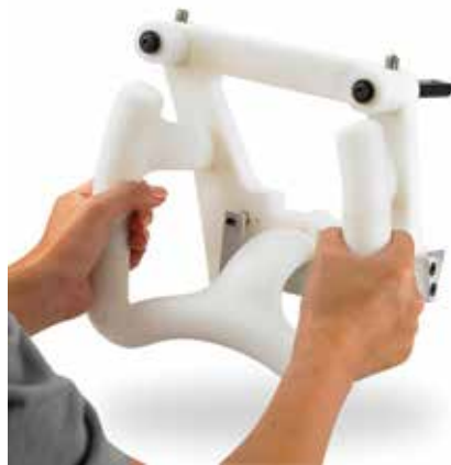
Using FDM, BMW prints jigs and fixtures that would not be possible with conventional machining and fabrication. 3D printing allows them to be easier to use and more functional.

Plastic manufacturing tools may also deliver some unexpected advantages. For example, Thogus uses FDM-made robotic attachments that absorb impact. In the event that the robot arm crashes into an obstacle, the FDM part is likely to isolate the arm from damages, which prevents expensive repairs and downtime. In another example, BMW uses plastic, hand-held tools because they are lighter and easier to handle, reducing worker fatigue.