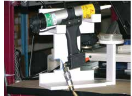
When machined fixtures were quoted at $12,000 and seven days, Thermal Dynamics opted to make them with FDM to save $10,000 and several days.

Before creating your first 3D CAD model and uploading it to a Fortus® 3D Production System, take materials and dimensional tolerance into account. While 3D printing is ideal for many manufacturing tools, it isn’t right for all of them. The main consideration for materials is whether plastic will suffice. Traditionally, jigs and