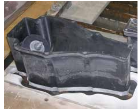
Top NASCAR team, Joe Gibbs Racing, uses FDM to make fixtures, some of which have been in service for more than two years and have cut lead time and expense by an average of 70 percent.