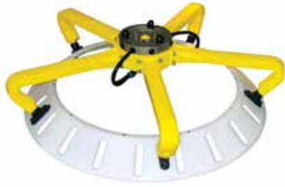
By using 3D printing to recreate a gripper with internal vacuum channels, Digital Mechanics eliminated five external hoses that hampered operations.

fixtures have been fabricated in metal. For some, metal may be a requirement. For others, metal may have been just a practical option because it is conducive to milling, turning, bending and fabricating. In this case, 3D printing may be an option. The range of FDM materials can offer chemical resistance (petroleum, solvents), thermal resistance (up to 390° F/ 200° C) and resilient mechanical properties.