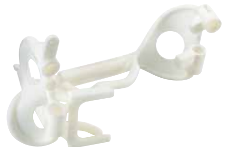
This ergonomic and lighter BMW hand tool reduced worker fatigue.

One very simple way to leverage the freedom of design is to consolidate assemblies into single parts. Often, jigs and fixtures are composed of many pieces.